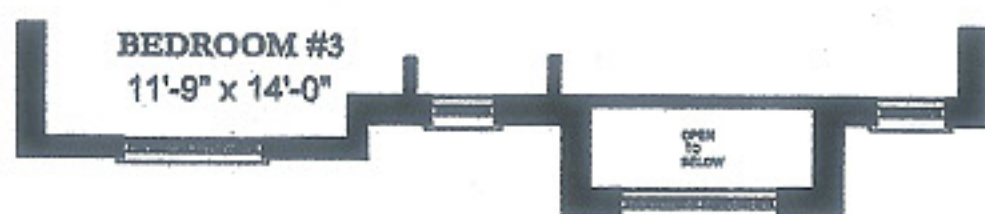
Alternate SECOND FLOOR PLAN (Elev. B) 1201 SF

All house renderings and interior drawings are artist's conceptions. Material specifications and floor plans are subject to change without notice. All floor plan dimensions are approximate. Where optional is noted on floor plans, the item is at extra cost. The number of steps to exterior door entrances depend on grading. E. & O.E.