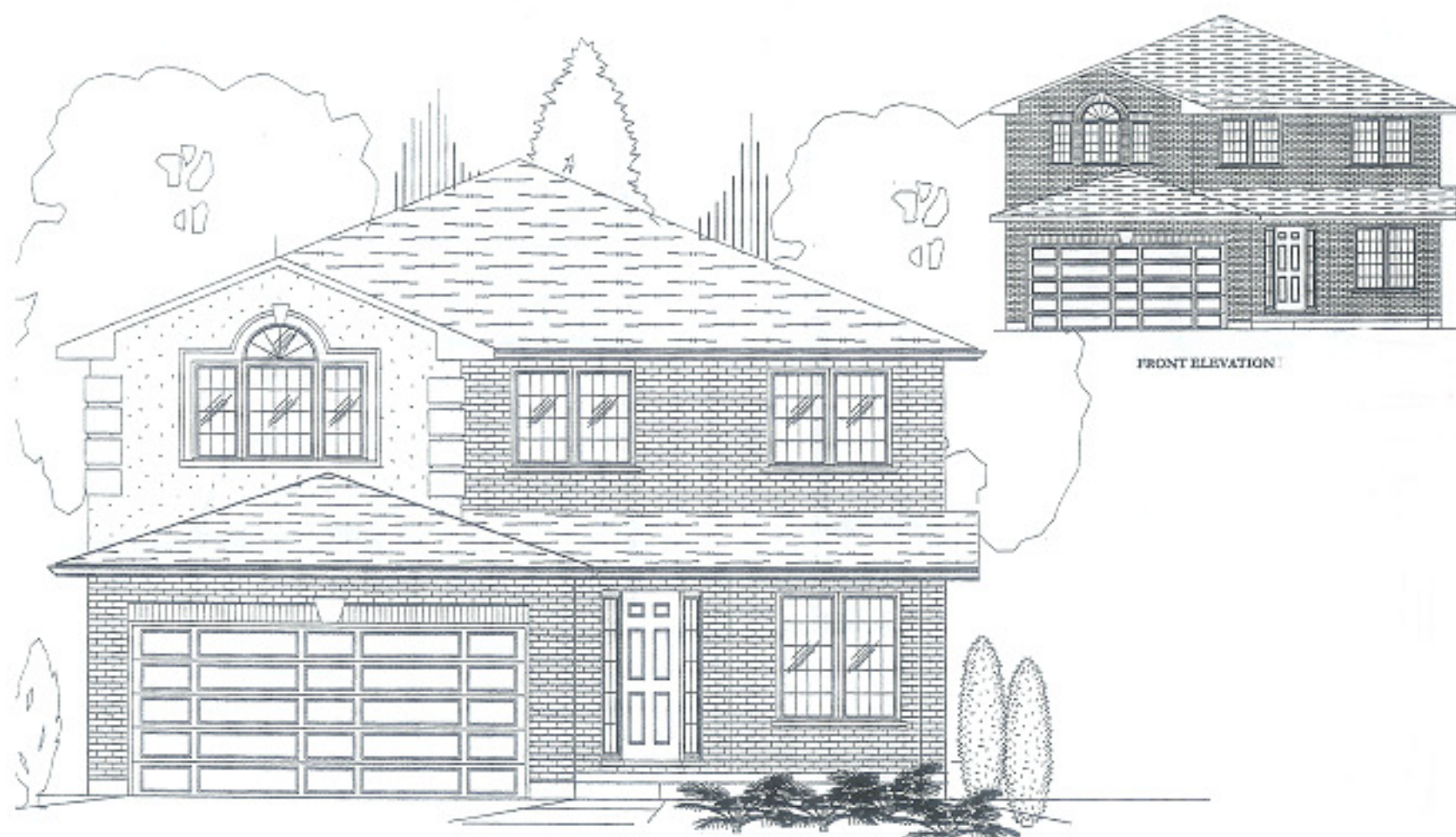
Front Elevation A